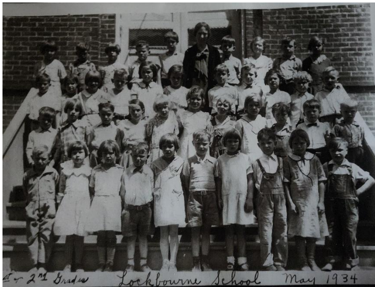
1 st & 2 nd Graders Lockbourne School May 1934

This article will tell you the history about navigation through Lockbourne.