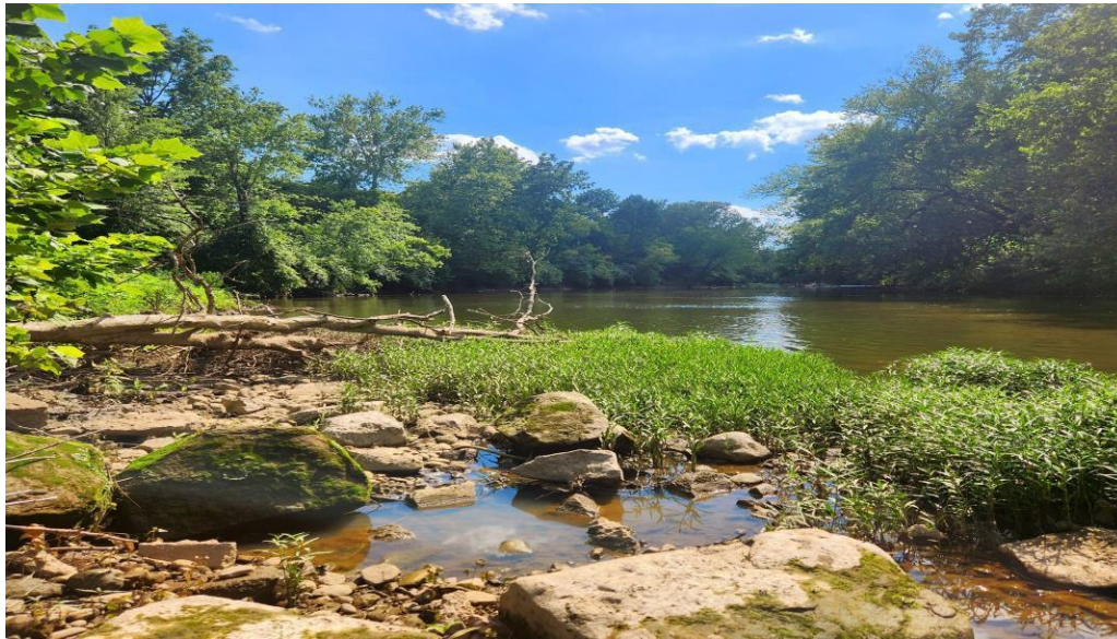
View of the Big Walnut Creek from Lockbourne