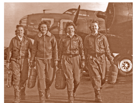
B17 bomber training 1944 at Lockbourne Army Airfield Base