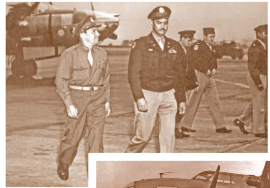
The last home of the Tuskegee Airmen

Originally known as the Lockbourne Army Airfield, the base was a training airfield for the Women Airforce Service Pilots (WASPs), the first “women with wings” to fly non-combat missions in U.S. military aircraft during World War II. After World War II, the Tuskegee Airmen 477th Composite Group and its supporting units were transferred to Lockbourne Army Air Base and stationed there until 1949. The Tuskegee Airmen played a major role in the integration of all U.S. military forces. In 1974, the base was renamed to honor World War I flying ace Capt. Edward V. Rickenbacker.